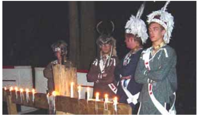
The Ceremonies Team performs at the Fall Induction Weekend.

The Ceremonies team had a successful year and put together two good ceremonies at the induction weekends. I'm looking forward to another year. Still, it would be nice to have more volunteers to either play a part in the ceremony or to help set up. Don't be afraid of memorizing lines; I can always use understudies in case of an emergency. Also there is no shortage of need for Elangomats and Nimats.