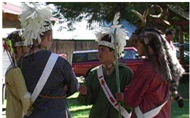
The Ceremonies Team gets ready to perform at the 2003 NE-3B Conclave.

Becoming part of the ceremonies team is a great way to prepare for your Brotherhood conversion. If you are taking the Brotherhood, I recommend that you give it a try. If you would like to become part of the team, send me an email at ceremonies@otahnagon.org .